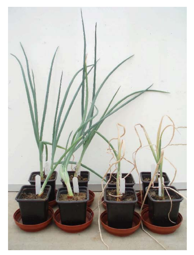
Figure 1: Healthy plants and plants showing Fusarium blight symptoms