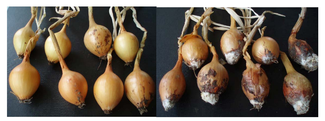
Figure 2: Healthy bulbs and bulbs with Fusarium basal rot symptoms

Inoculation of soil with 1 g/kg of the talc Fusarium chlamydospore inoculum resulted in high disease pressure with 40% plant deaths due to Fusarium at the end of the experiment. Compost colonised with Trichoderma viride S17A and incorporated in soil at 25% reduced Fusarium in onion plants by 48% compared with the soil control (Fig. 3). After growing in soil at this level of Fusarium infestation, average weight of onions without disease symptoms was higher following incorporation of 25% T. viride S17A-colonised compost than in the soil control (Fig. 4). Compost without Trichoderma and incorporated in soil at 25% had no effect